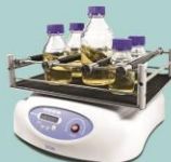
PSU-20i, Orbital Shaker