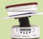
Multi Bio 3D, Mini Shaker