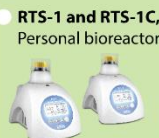
RTS-1 and RTS-1C, Personal bioreactor