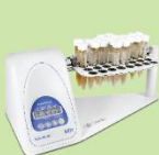
Multi RS-60, Programmable rotator