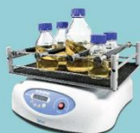
PSU-20i, Orbital Shaker