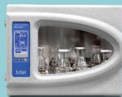
ES-20/80, Orbital Shaker-Incubator

Applications: • Microbiology • Extraction • Cell cultivation