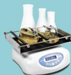
PSU-10i, Orbital Shaker

Applications: • Microbiology • Extraction • Cell cultivation