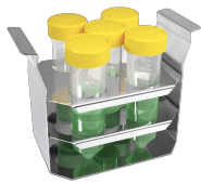
TR-5/30 BS-010406-KK rack

Test tube rack for \varnothing 30mm tubes, capacity 5 tubes. WxDxH: 155x90x112mm