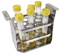
TR-16/19 BS-010406-FK rack

Test tube rack for \varnothing 30mm tubes, capacity 5 tubes. WxDxH: 155x90x112mm