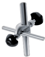
Double clamp for MM-1000 BS-010306-LK

Centrifugal stirrer ( \varnothing 60 mm)