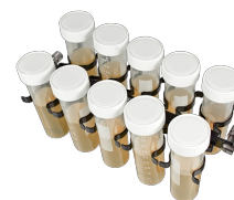
PRSC-10 BS-010117-JK platform

Can accommodate 22 tubes 16 mm diameter (15 ml).