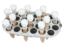
PRS-26 BS-010117-GK platform

Can accommodate 26 tubes 10–16 mm diameter (1.5–15 ml).