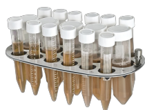
PRS-5/12 BS-010117-HK platform

Can accommodate 26 tubes 10–16 mm diameter (1.5–15 ml).