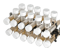
PRSC-22 BS-010117-LK platform

10 tubes 20–30 mm diameter (up to 50 ml tubes).