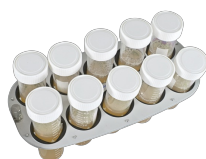
PRS-10 BS-010117-IK platform

5 tubes 20–30 mm diameter (50 ml tubes) and 12 tubes 10–16 mm diameter (1.5–15 ml tubes).